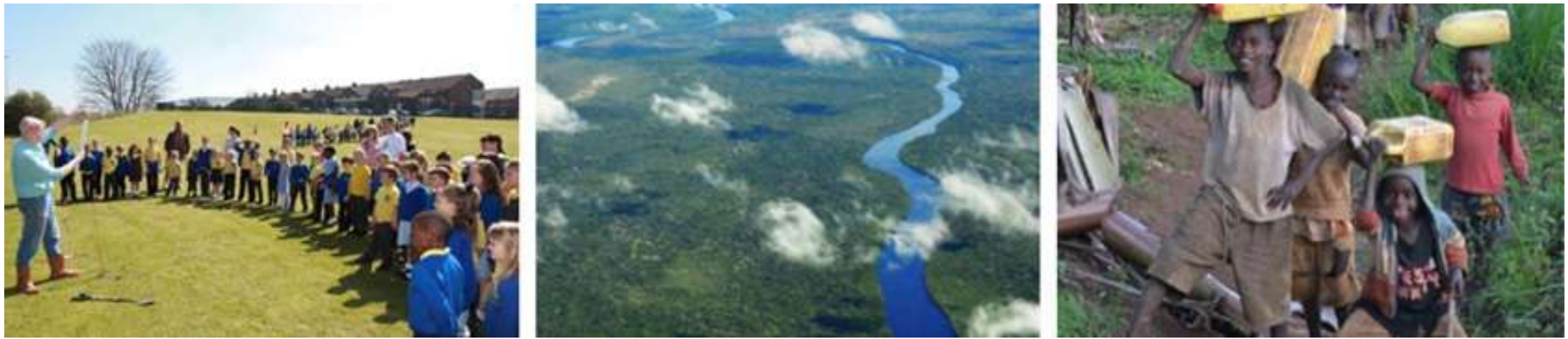
Sample Carbon Offsetting Projects - UK Schools Tree Planting - Amazon Avoided Deforestation, Brazil - Clean Water projects, Rwanda

The offsetting process is simple and straightforward - just visit www.carbonfootprint.com/carbonoffset.html and type in your CO 2 tonnage (from the front page of this report) and this will show you the latest range of projects and their pricings. Certification is available to download online.