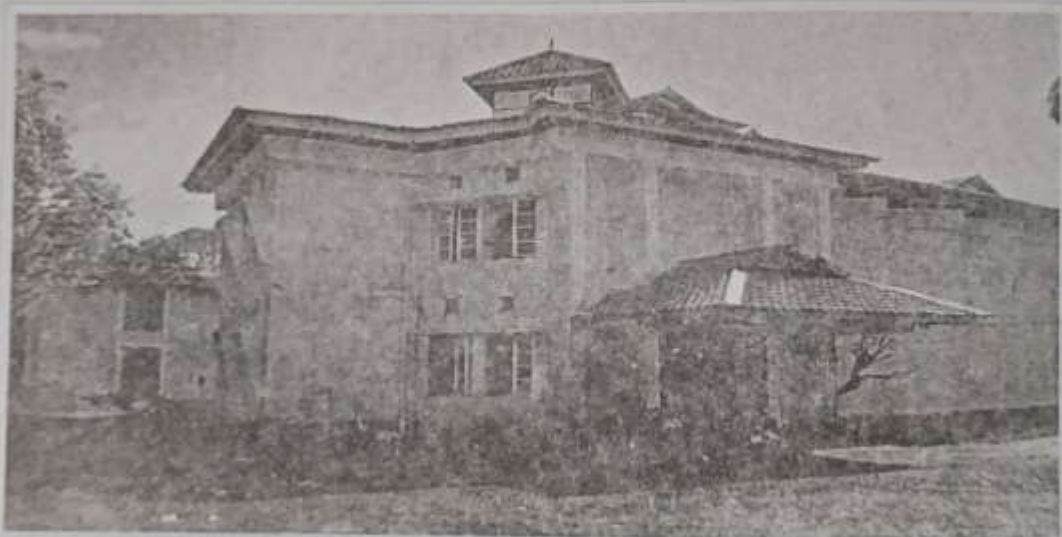
Hostel for Men